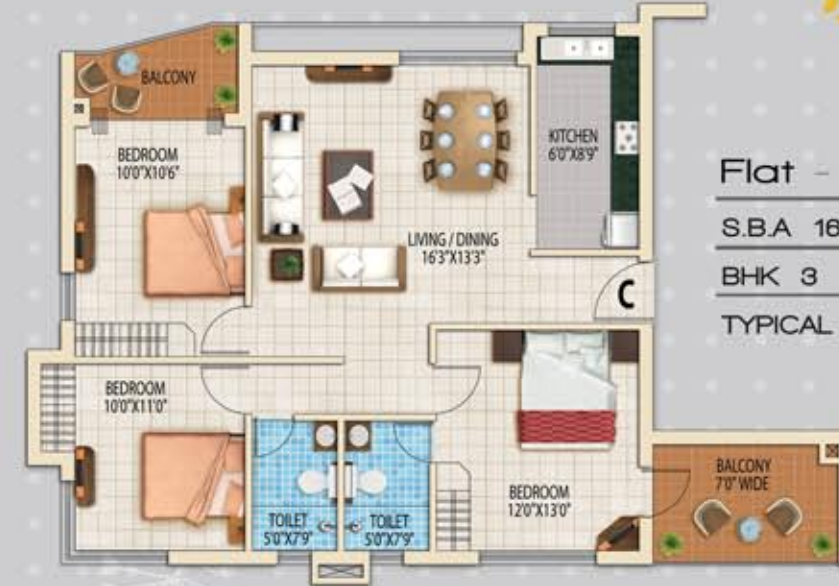
Flat - C S.B.A 1802 SQ.FT BHK 3 TYPICAL 2ND TO 4TH FLOOR