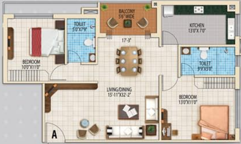
Flat - A S.B.A 1305 SQ.FT BHK 2 1ST FLOOR