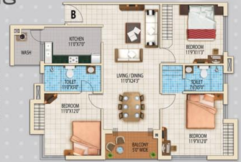
Flat - B S.B.A 1527 SQ.FT BHK 3 TYPICAL 2ND TO 4TH FLOOR