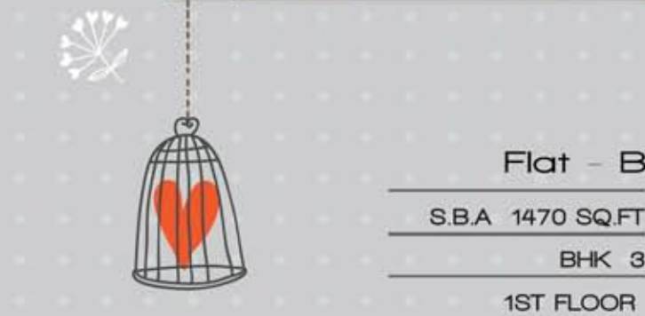
Flat - B S.B.A 1470 SQ.FT BHK 3 1ST FLOOR